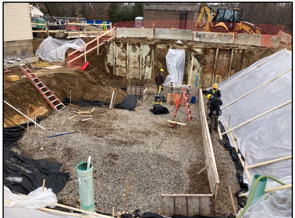
Installation of Forms for Footings