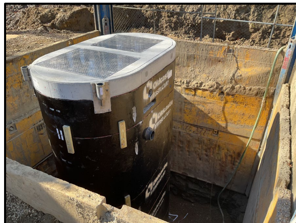
Installation of Wetwell/Valve Vault