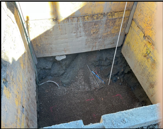
Pumped-Out Wetwell/Valve Vault Excavation