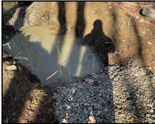
Silt Containment Area Excavation