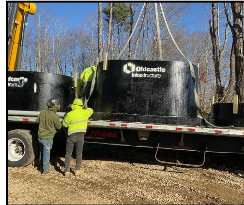
Wetwell/Valve Vault Delivery