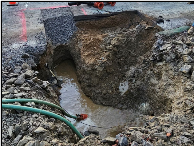
Excavated Sewer Main